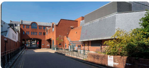
Current Service Yard & Car Park Access