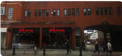
Current Access Entrance