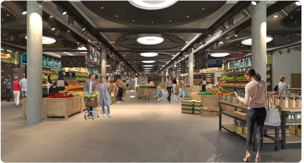
Illustrative view of the proposed food hall

You can contact us directly via our dedicated online Community Hub, in addition to being able to send us an email, speak with one of the team over the phone, or post a letter. We look forward to hearing from you.