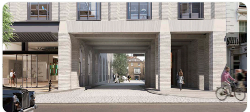
Proposed Access Entrance