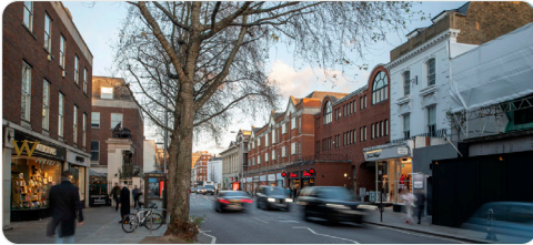
81-103 King's Road- Current Building